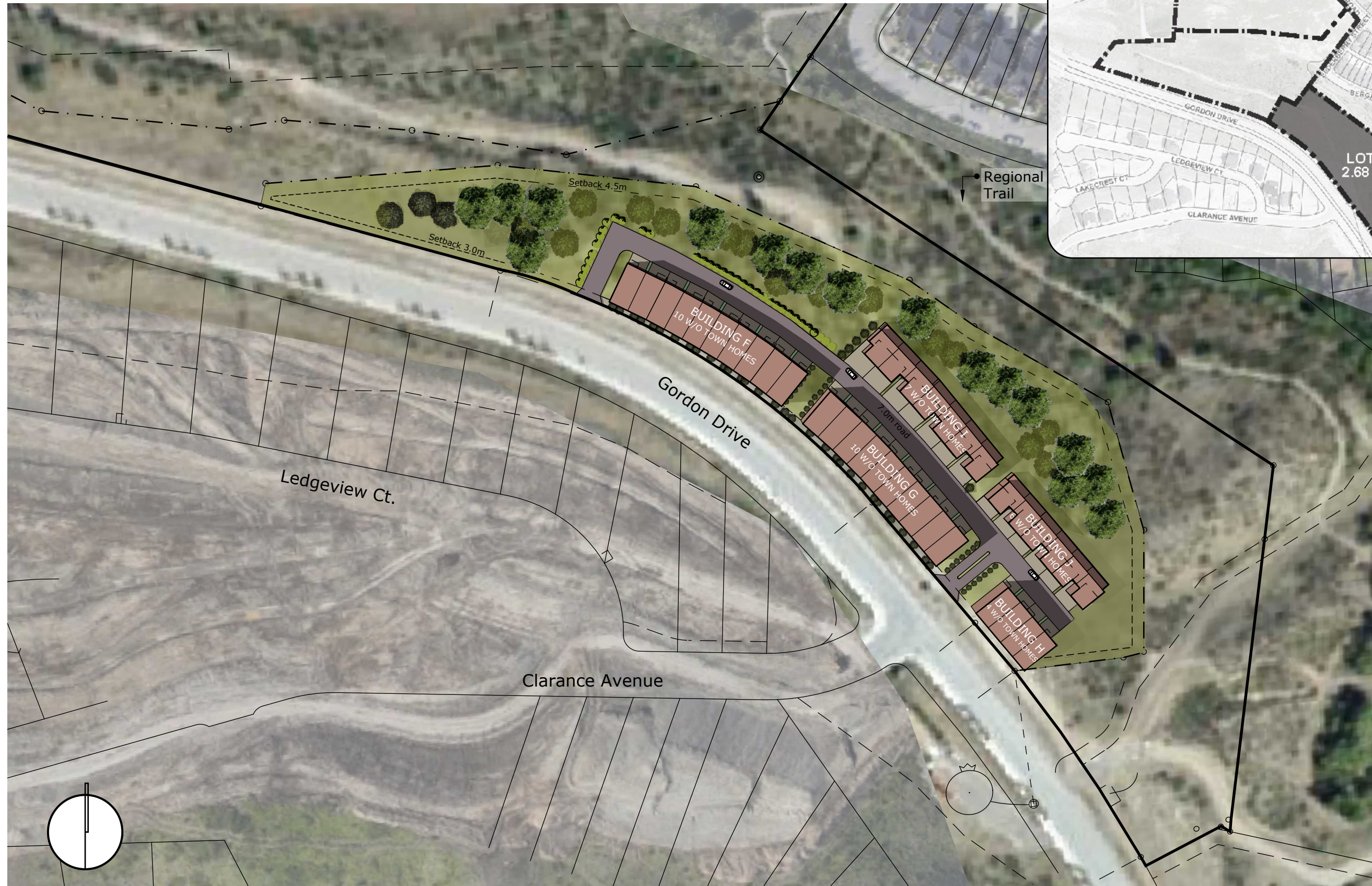
FROST ROAD MULTIFAMILY - PLAN VIEW FEBRUARY 2024